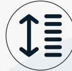
6 Metres Reach