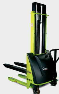
TX Manual traction and electrohydraulic lifting technology