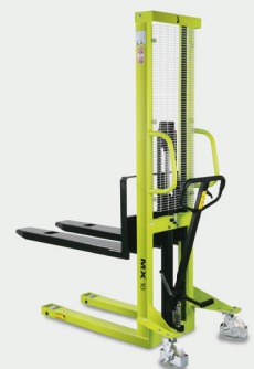
MX Robust and resistant manual stacker, simple to use