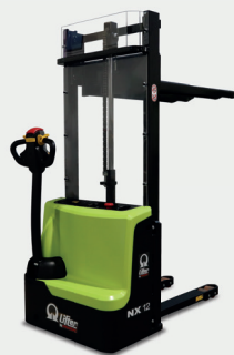
NX Reliable performance for professional needs