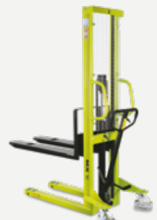
MX Robust and resistant manual stacker, simple to use