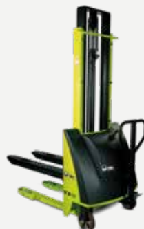
TX Manual traction and electrohydraulic lifting technology