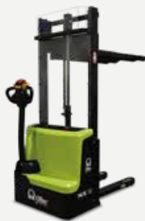
NX Reliable performance for professional needs