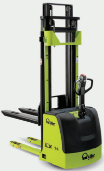
LX Strong and reliable full optional stacker