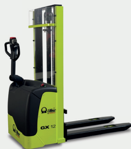
GX Designed for professionals, made for every need