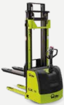
LX Strong and reliable full optional stacker