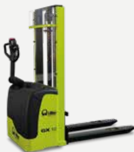
GX Designed for professionals, made for every need