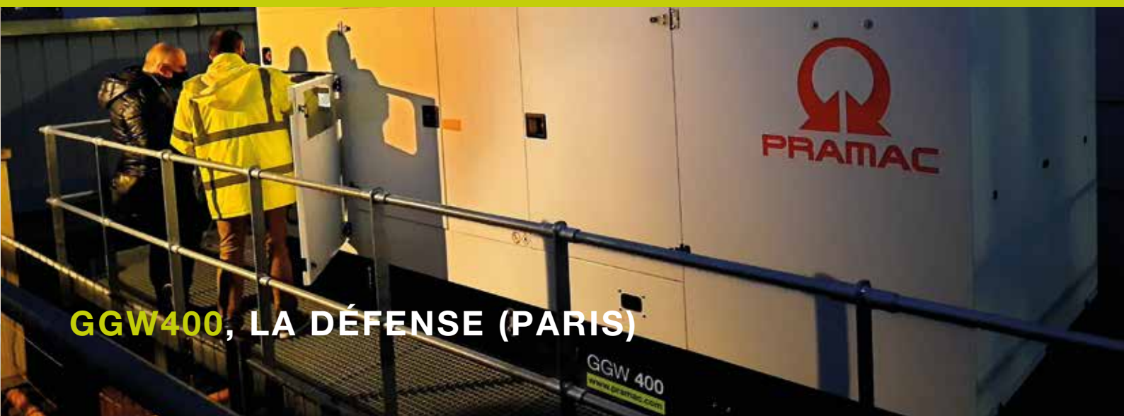
GGW400, LA DÉFENSE (PARIS)

**The data refer to the products for the Non European markets